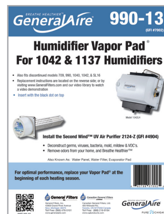
GF-990-13 Vapor Pad®