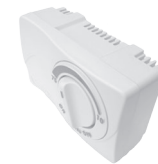
GF-MHX3 Manual Humidistat Included in GF-1042DMM